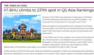
IIT-BHU climbs to 237th spot in QS Asia Rankings