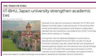
IIT (BHU), Japan university strengthen academic ties