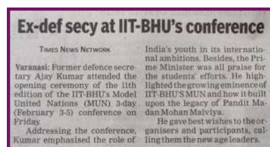
IITBHU MUN hosts ex-defence secretary