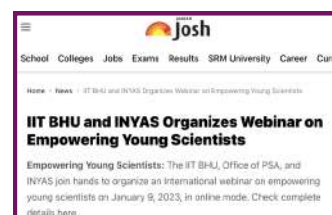
INYAS webinar at IIT (BHU)