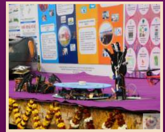
Jhanki on the occasion of 74th Republic Day and 108th Foundation Day of BHU!